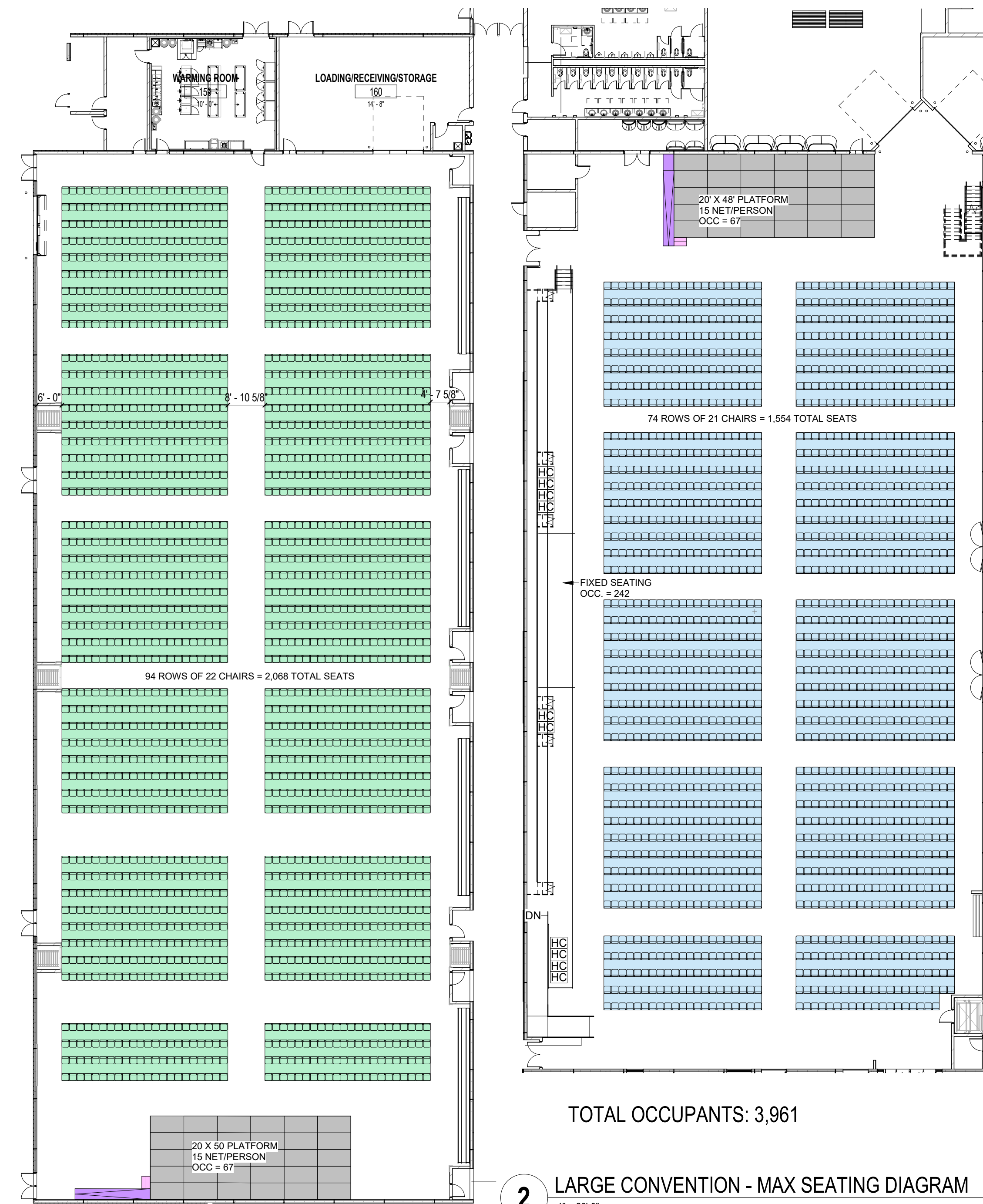
2 LARGE CONVENTION - MAX SEATING DIAGRAM 1" = 20'-0"