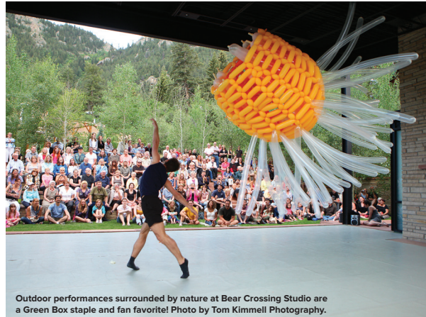
Outdoor performances surrounded by nature at Bear Crossing Studio are a Green Box staple and fan favorite!