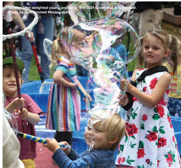
Toddler Time delighted young and old at the 2021 Green Box Arts Festival.

Green Box partners with local schools, community organizations, and artists to enhance reach, furthering our commitment to nurturing creativity and appreciation for different perspectives.