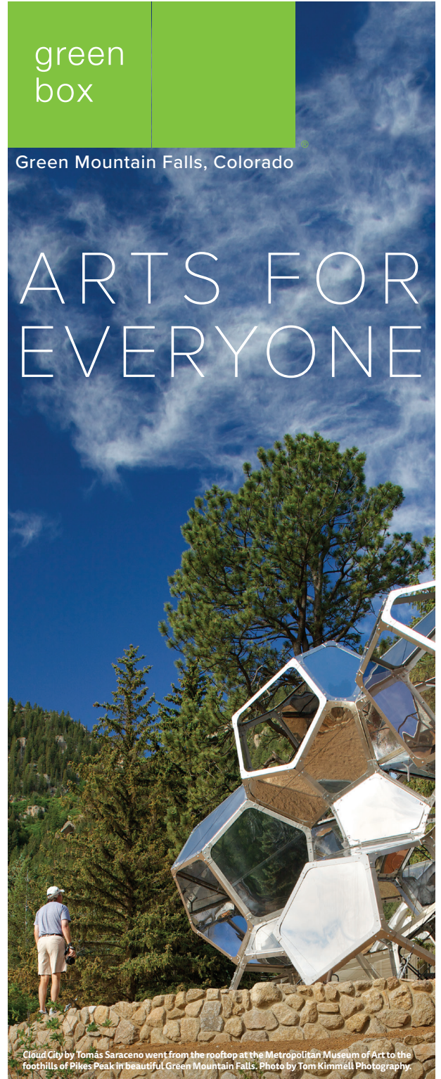
Cloud City by Tomás Saraceno went from the rooftop at the Metropolitan Museum of Art to the foothills of Pikes Peak in beautiful Green Mountain Falls.