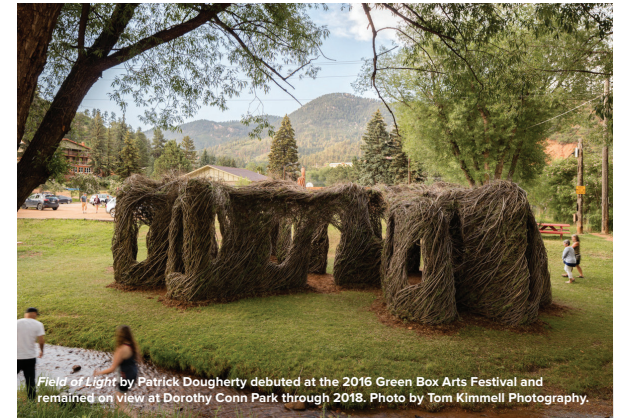
Field of Light by Patrick Dougherty debuted at the 2016 Green Box Arts Festival and remained on view at Dorothy Conn Park through 2018.