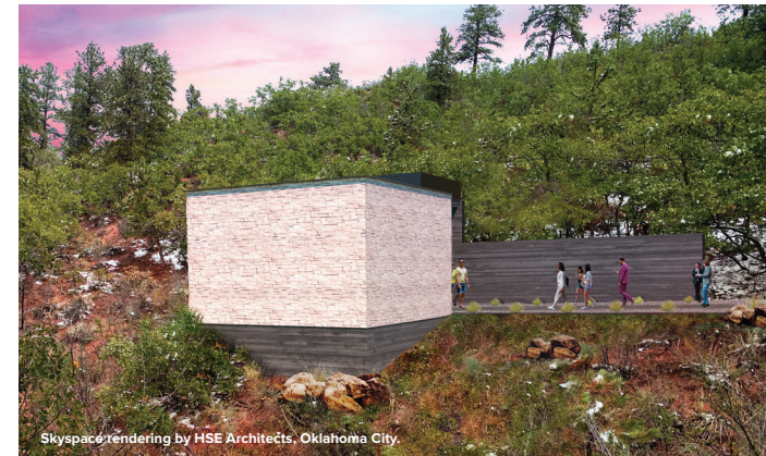
Skyspace rendering by HSE Architects, Oklahoma City.