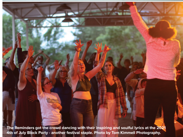
The Reminders got the crowd dancing with their inspiring and soulful lyrics at the 2021 4th of July Black Party - another festival staple.