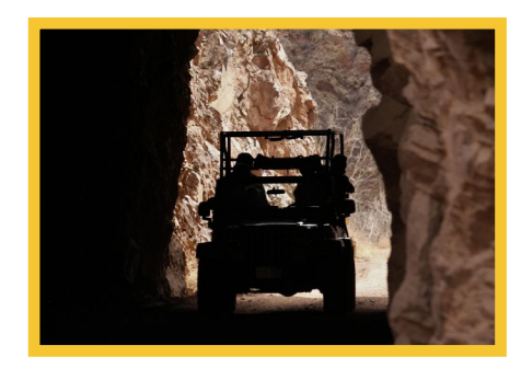
RAFTING, JEEPING, & CAMPING