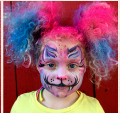
CRAZY HAIR & DELUXE PAINT

A portion of your event total directly supports Minnesota Zoo programs. Food and beverage prices are subject to applicable sales tax and 19% surcharge.