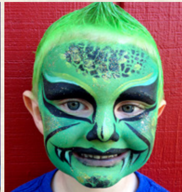
DELUXE FACE PAINT