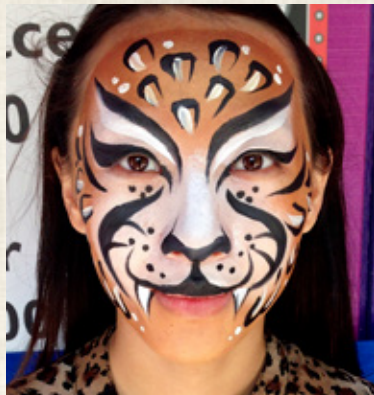
DELUXE FACE PAINT