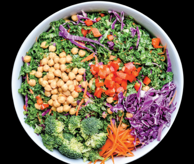
Kaleidoscope Peanut Kale Power Salad